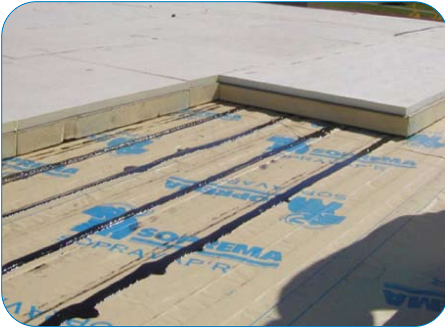
The quantity of adhesive is critical for proper adhesion. Manufacturer's recommendations must be followed and quality control carefully monitored.