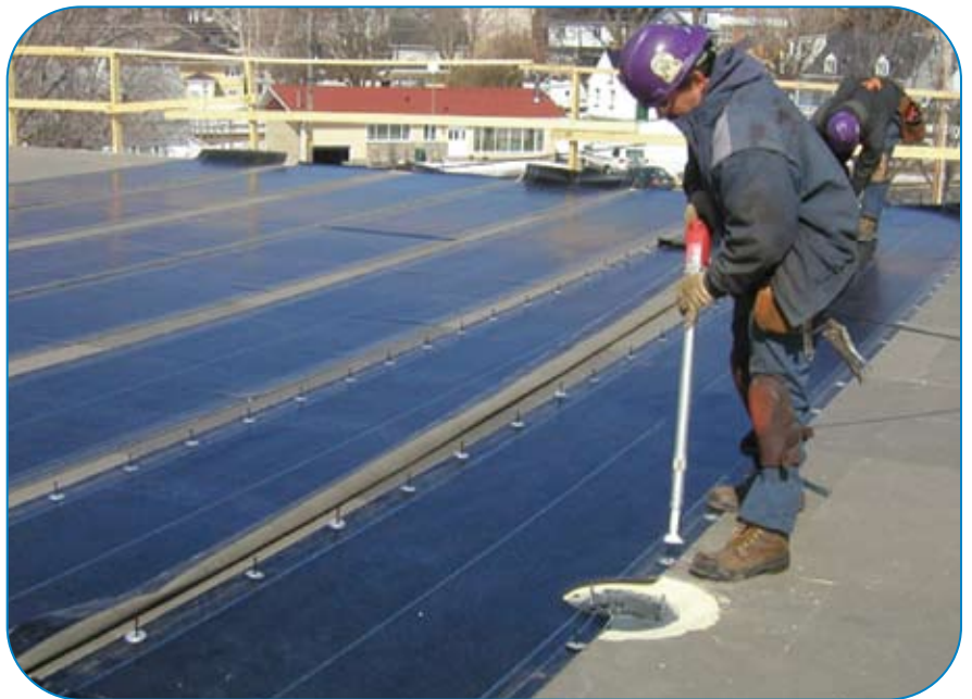
Proper quantity and spacing of fasteners prevents movement of roofing system components, and most importantly in withstanding wind uplift.