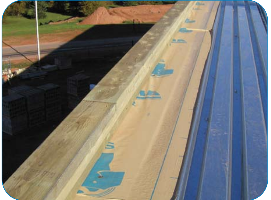
Coordination of the trades to ensure air/vapour barrier continuity is simplified if a self-adhesive barrier is installed by the carpenter before the parapet is constructed.

In a retrofit project, there is no simple panacea for establishing air/vapour barrier continuity between the wall and roof. The roof designer must use the arsenal of detailing solutions available to limit air/vapour movement as much as possible.