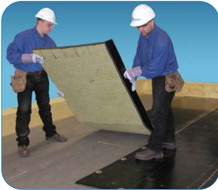
When re-covering, a mineral wool board with a factory-laminated membrane has sufficient compressibility to provide a smooth surface for membrane installation over existing roofing materials.

Where the original roof provides the option of re-covering, the potential for reducing waste and consumption of replacement products is substantial. Local bylaws should be reviewed as to re-cover requirements and limitations. The option is only viable if the components underneath the membrane are in good condition (part of the original design for sustainability), and the structure can resist any additional loads from the recover materials. Non-destructive testing should be followed by strategic core testing to confirm original findings as to whether re-cover is a viable choice. Non-destructive evaluation includes electrical capacitance, infrared thermography, nuclear hydrogen detection and electronic field vector mapping.